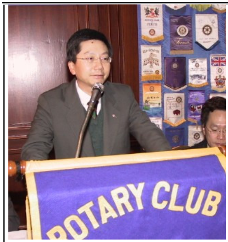
PP Li announcing our Rotary Friendship Golf Invitational Tournament 2004.