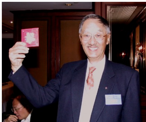
Second prize winner was PP John IV.