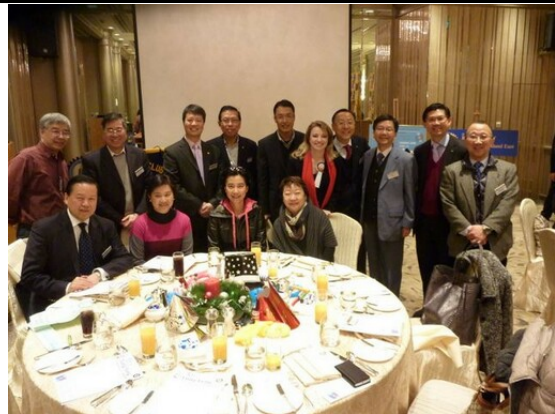
Some table photos at the luncheon meeting