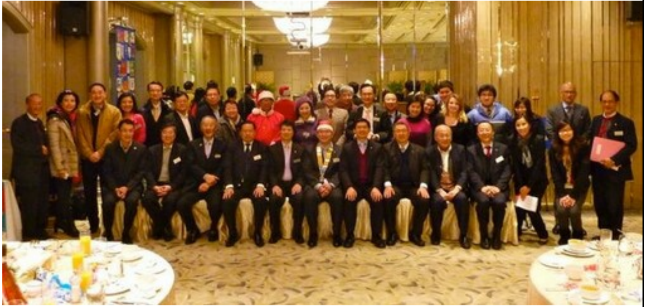
Group photos of members, Rotarators, Interactors & visiting guests.