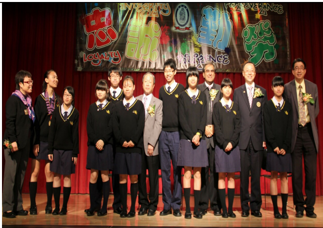
Board Members received the Pins