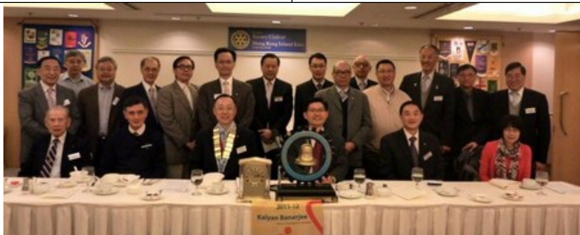
Group photo with members, visiting Rotarians & guest