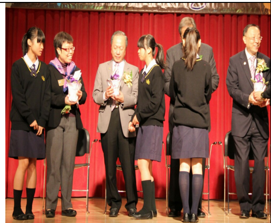
Nice souvenirs prepared by board members