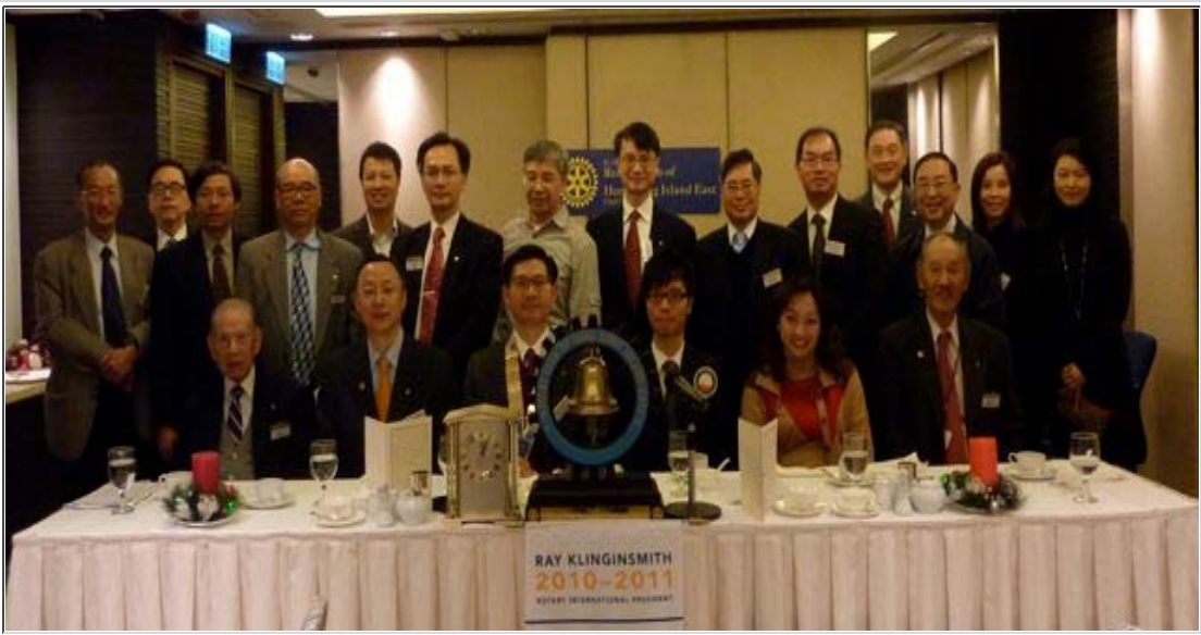
Member group photo of Rotary Club of Hong Kong Island East