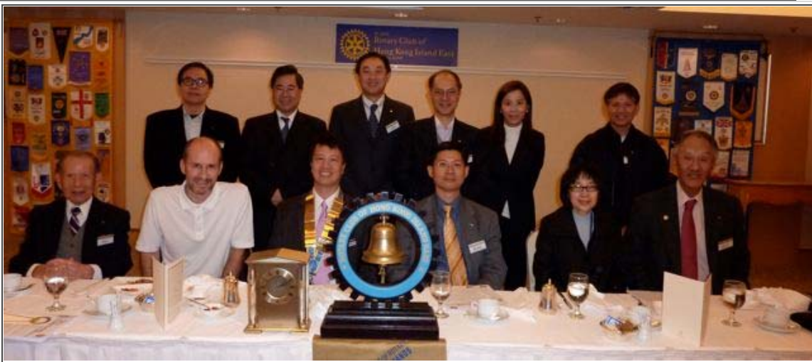
Group photos with speaker, visiting Rotarian & members