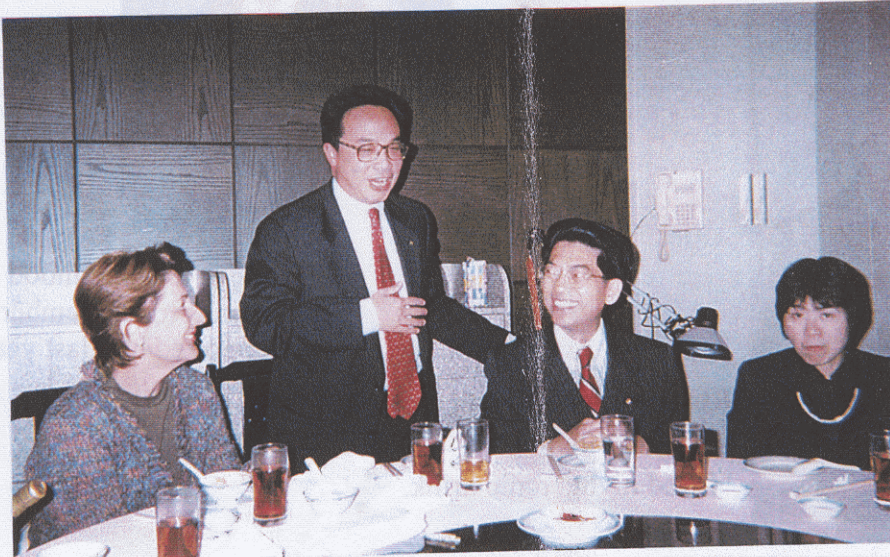
Pres. Desmond gives words of praise for C.Y.'s leadership.

香港東區扶輪社週報 THE ROTARY CLUB OF HONG KONG ISLAND EAST