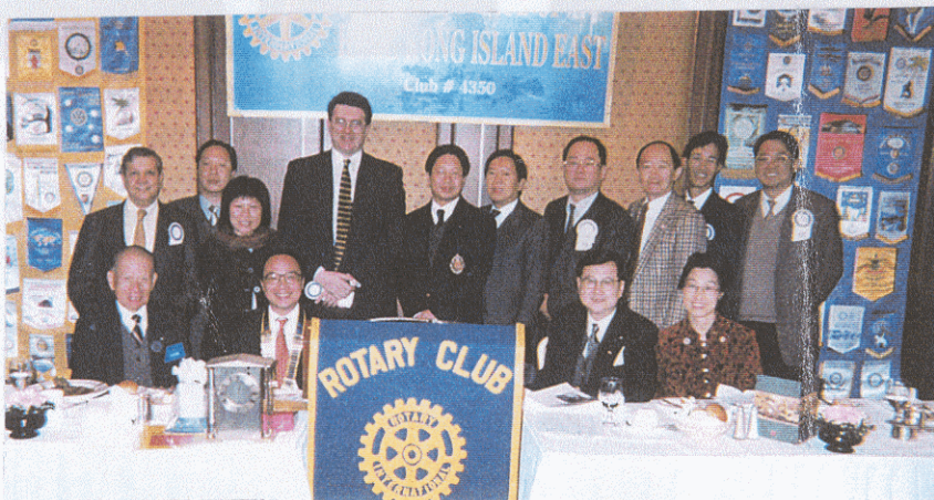
Visitors and guests to The club on 8 Dec., 1999