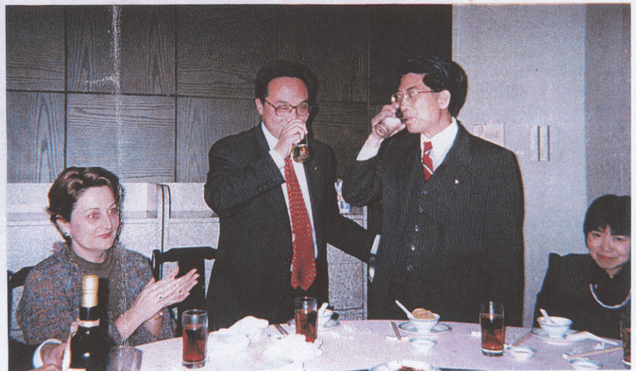
A well-deserved toast to IPP C.Y..