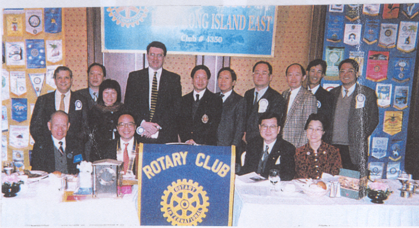
Visitors and quests to The club on 8 Dec., 1999