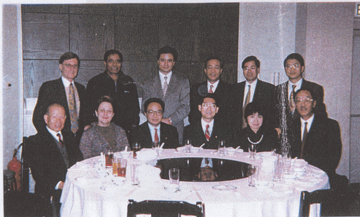
The gathering to honour IPP C.Y..