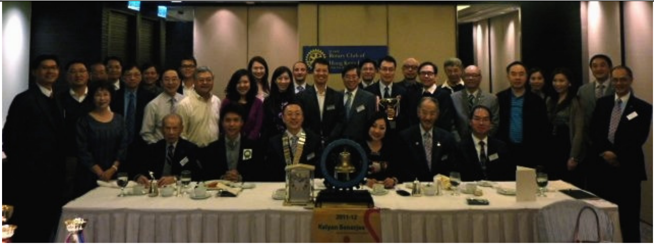
Group photo with members, visiting Rotarians & guests