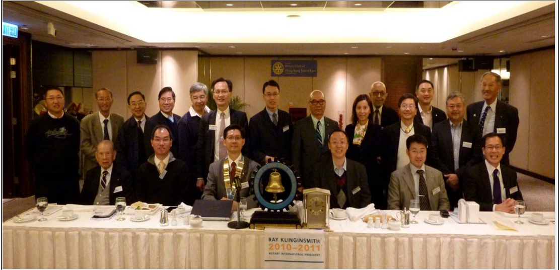
Member group photo of Rotay Club of Hong Kong Island East