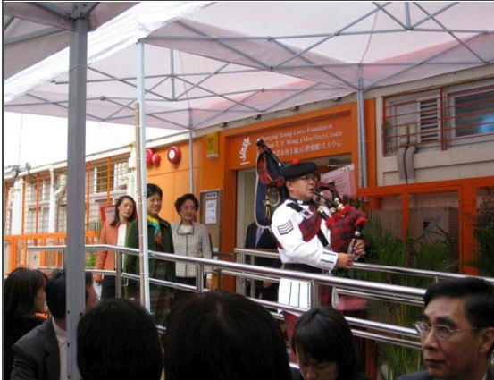
Mrs. Selina Tsang, wife of our Patron, The Hon. Mr. Donald Tsang GBM, CE of HKSAR arrived at the Centre