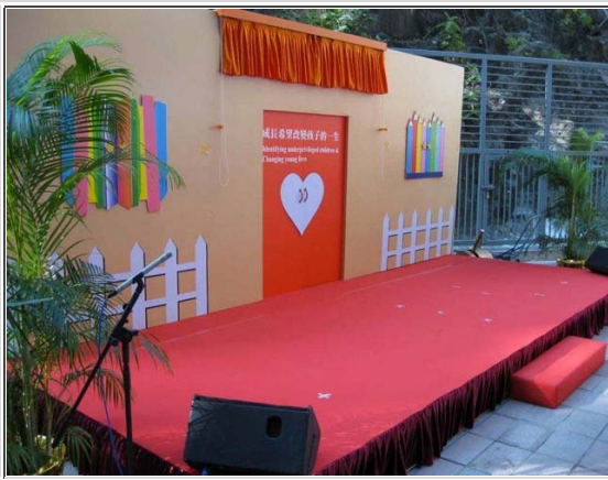
The stage of the opening ceremony