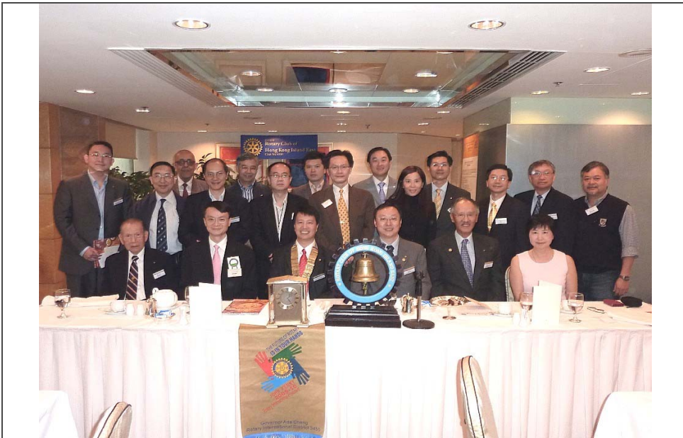
Group photo of our meeting on 2 December, 2009

Changing Young Lives Foundation Madam T Y Wong (Alee Vee) Centre Official Open Ceremony