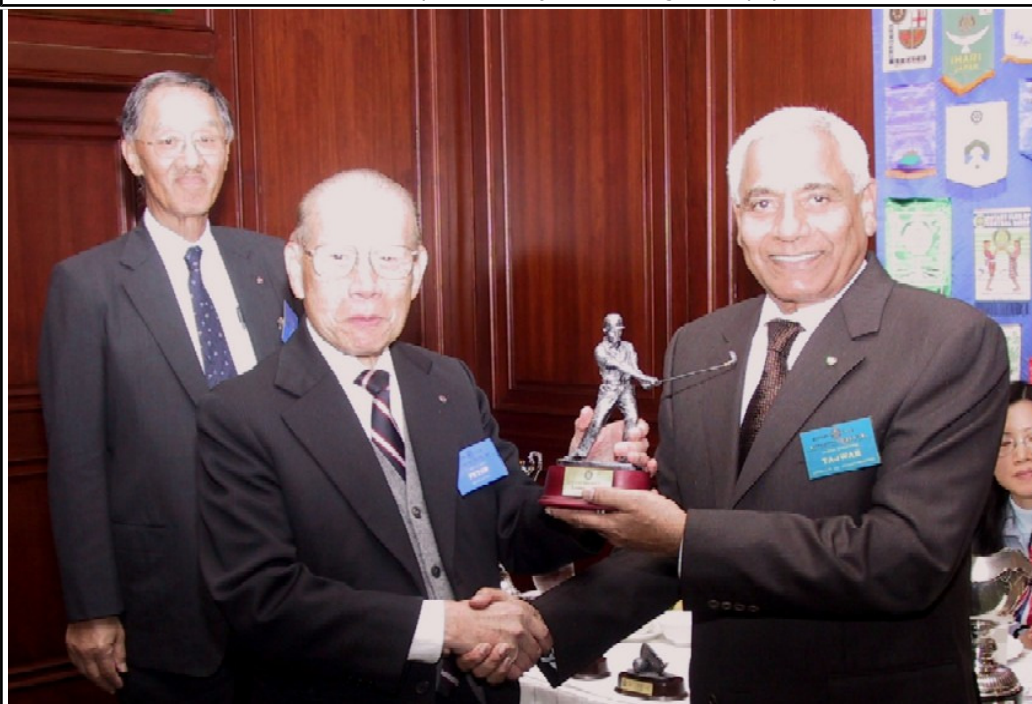
PP Taj also won the Longest Drive on the front nine.