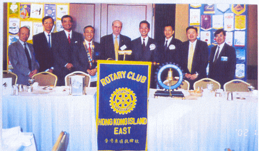
December 4 Group photo