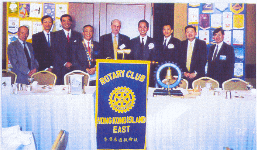
December 4 Group photo