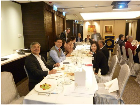
Members attending the AGM