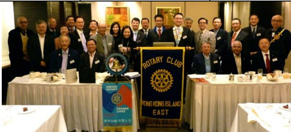
Group photo of members of HK Island East,