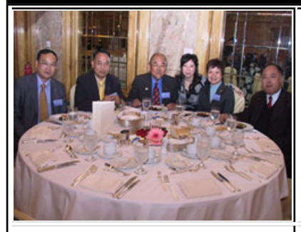
Totally 93 members and guests attended this week's Joint Luncheon Meeting