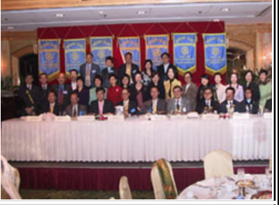
Members & guest from the Rotary Club of HK City North