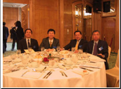
Members from Rotary Club of HK Harbor