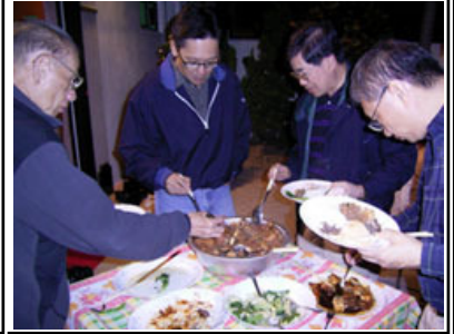
Members trying the "BASIN" food