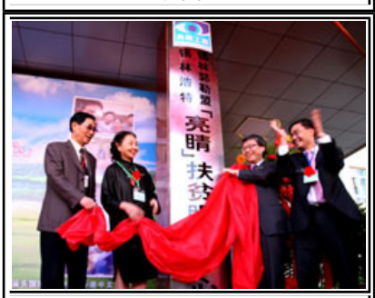
Opening ceremony of Project Vision in Inner Mongolia