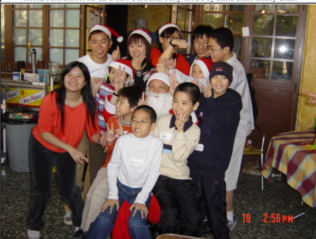
Pictured are the happy children of the school sitting on the lap of Santa Claus.