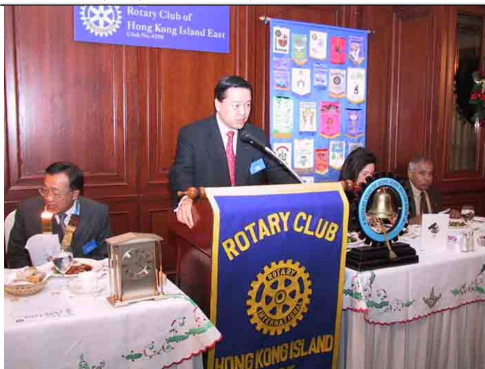
PP Tim reported on the result of the election.