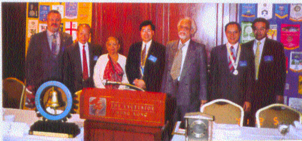
Group photo on December 5, 2001.