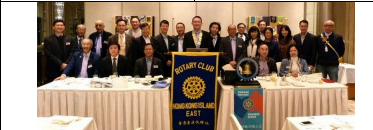
Group photo of members of HK Island East, visiting Rotarian & guests.