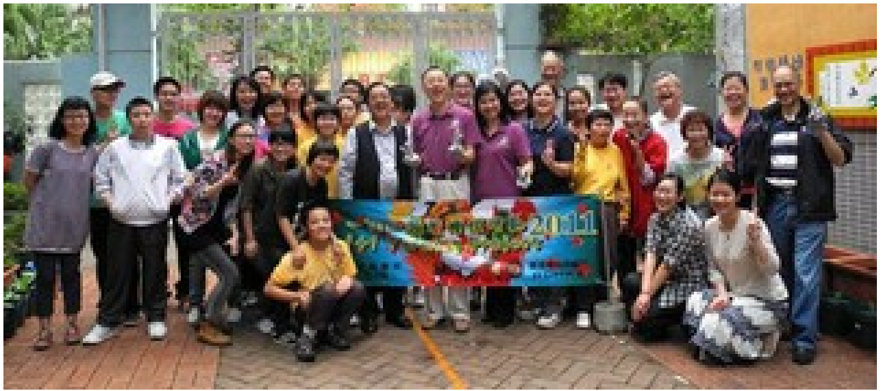
Choi Jun School students use their own farming vegetables to make some dishes for our Rotarians