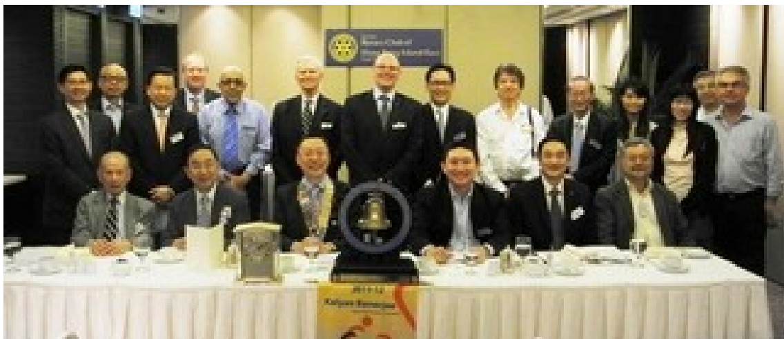
Group photo with members, visiting Rotarians & guests