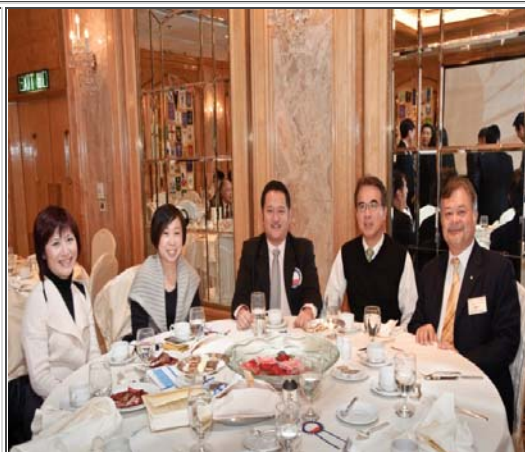
Other visiting guests and Rotarians photos