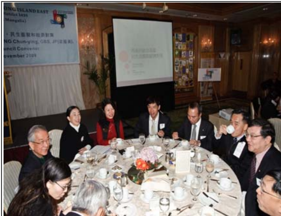
Past Presidents & current Presidents from other Rotary Clubs