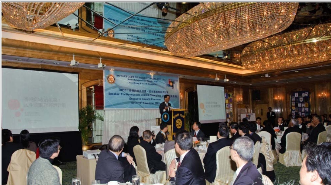
The Hon. Leung Chun-ying GBS, JP gave his speech and the topic was "The Political Phenomenon, the Appearance of People's Livelihood and the Countermeasure to the Economic Outlook in Hong Kong"