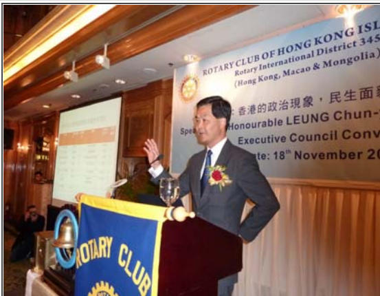
The Hon. Leung Chun-ying GBS, JP conducted some Q & A with the audience