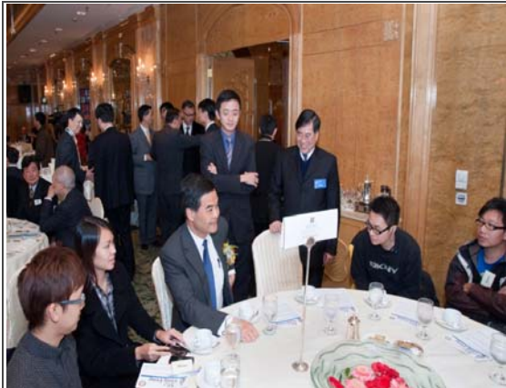
Hon. Leung Chun-ying GBS, JP received interview from press media