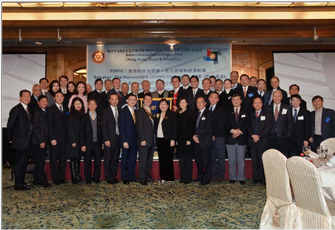
Group photo with PDGs, PPs, current Presidents and all the visiting Rotarians