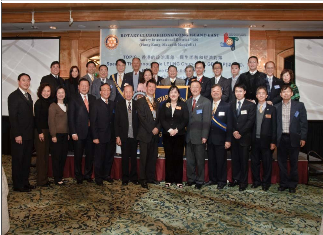
Members & guests from Rotary Club of Hong Kong Island East