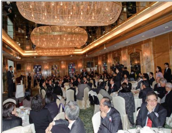
Many Rotarians and visitors attended the luncheon and our club was thankful for their support