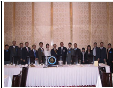
Group Picture with members & visiting guests.