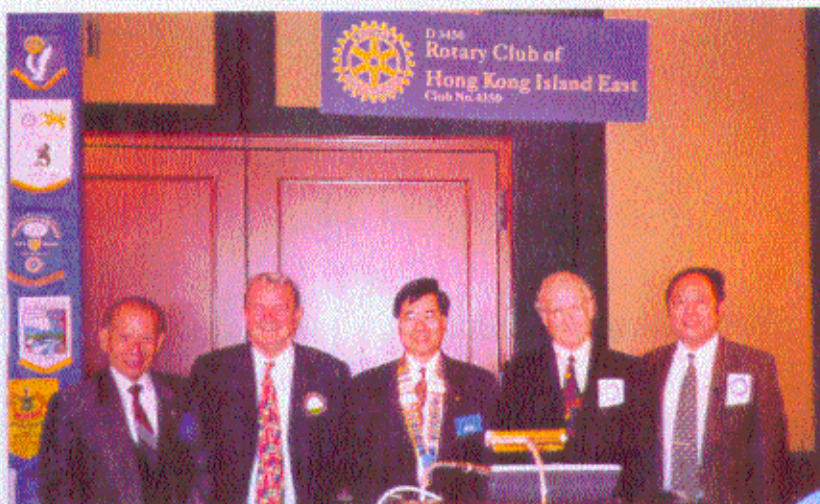
Visitors to our club on 28 th November, 2001