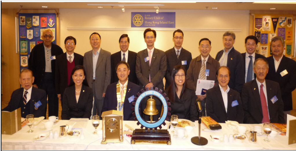
Group photo with members & 2 Ambassadorial Scholars