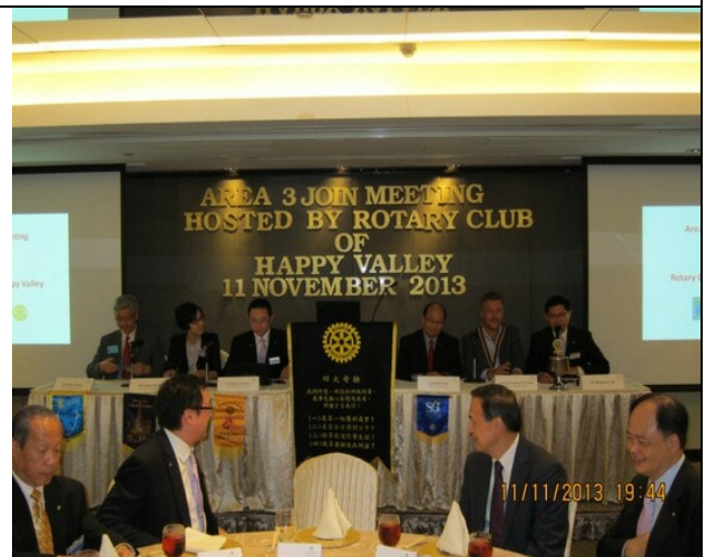
Getting ready for Second Area 3 Joint Meeting