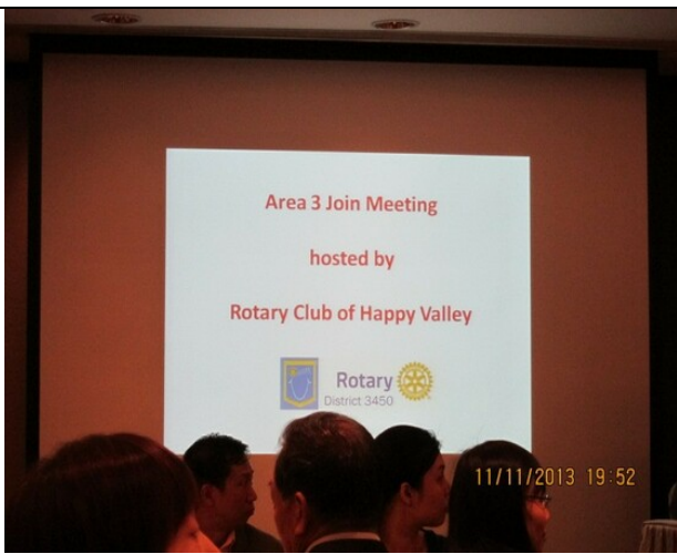
RC Happy Valley hosting this Area 3 Joint Meeting