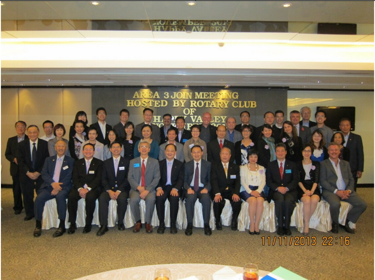
Group Photo of our participants of the Joint Meeting