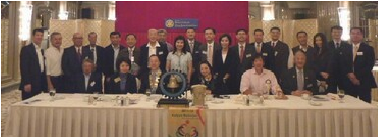
Group photo with guest speaker, visiting guest & members