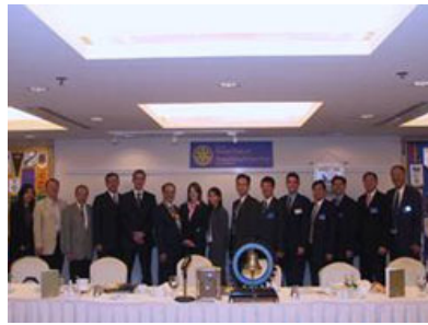
Group photo of the members, visitors & four Ambassadorial Scholars