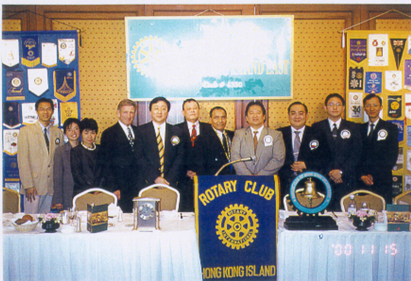
Visitors & guests to the Club , 15 th November, 2000