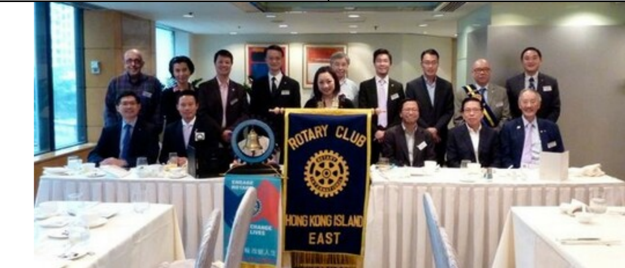
Group photo with members, visiting Rotarians & guest.