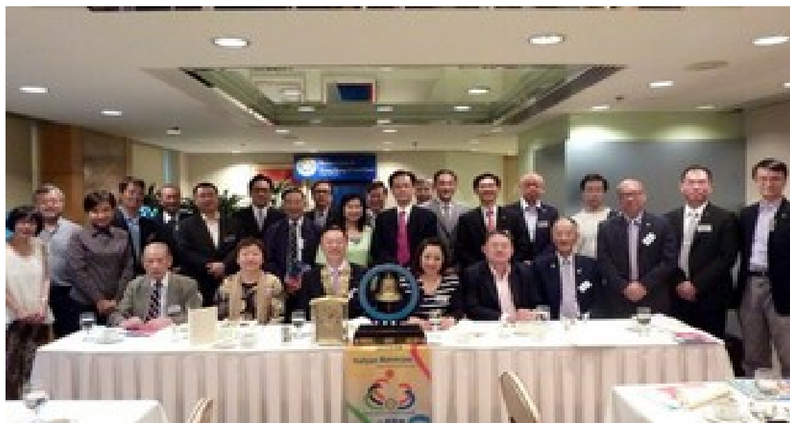
Group photo with Guest speaker, visiting Rotarians & members