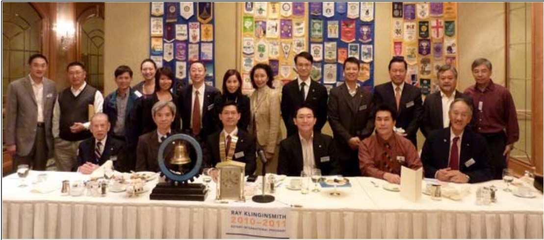
Group photos with members, guest speaker & visiting Rotarian