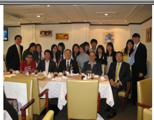
Our board members has attended the recent board meeting of Rotaract Club of Lingnan University