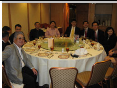
Farewell dinner to Osaka Jonan at World Trade Centre Club on 08 Nov.