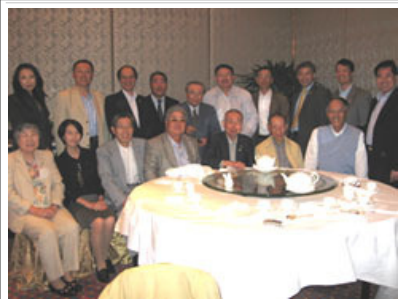
Lunch "Yam Cha" photos with members from RC of Osaka Jonan & RC of HKIE on 07 Nov.