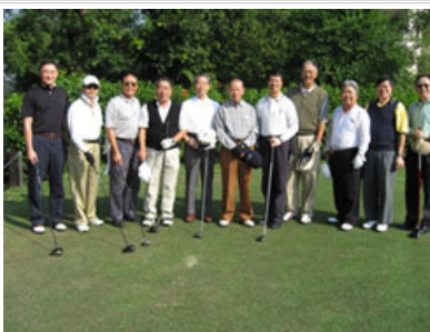
A round of golf with Osaka Jonan at Fanling HK Golf Club on 08 Nov.