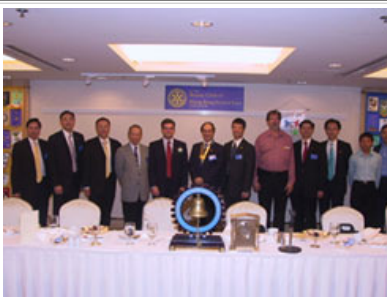
Group photos with members, visiting Rotarians & guests