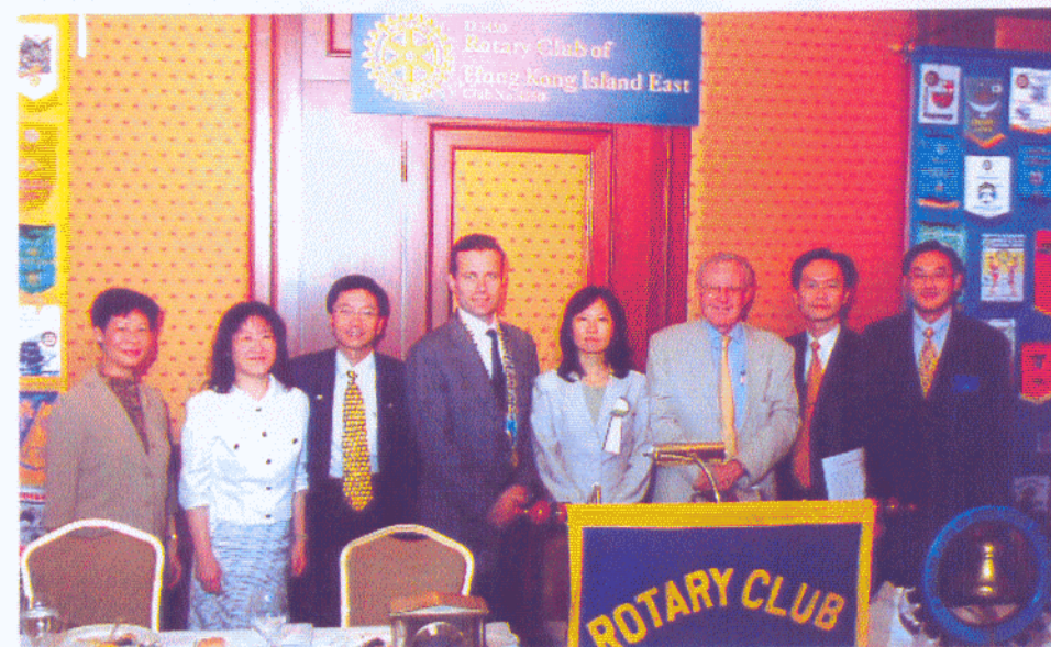
Group Photo of Pres Chns with our speaker, guests, & visiting Rotarians on 30 October, 2002.