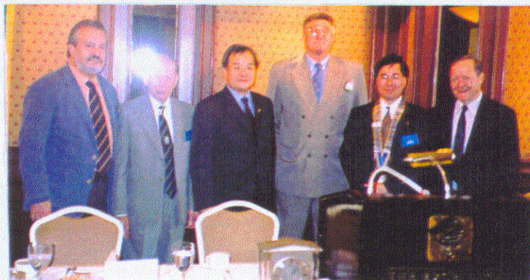
Group Photo of November 7, 2001