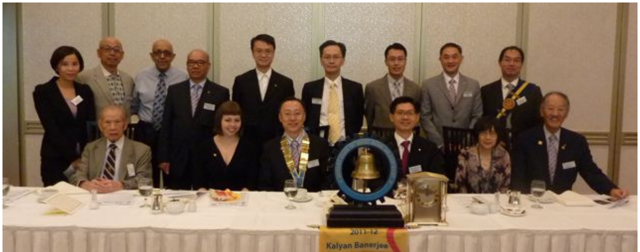
Group photo with guest speaker, visiting Rotarian & members