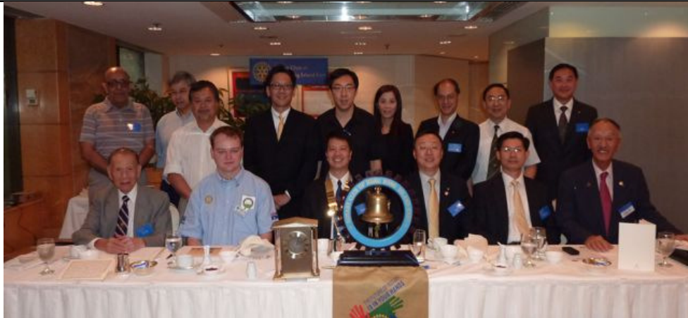
Group photo with members and guest speaker