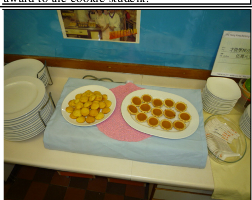
These are the student's finish products