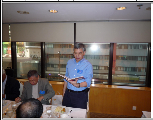
SAA PP Rudy reported the Red Box collection