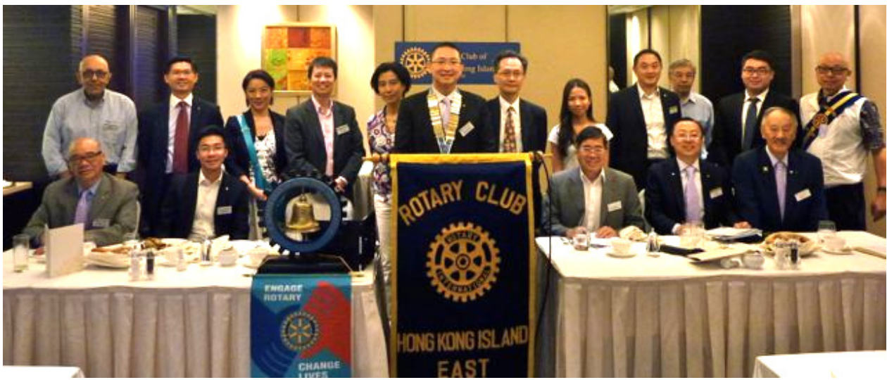
Group photo of members & visiting guests