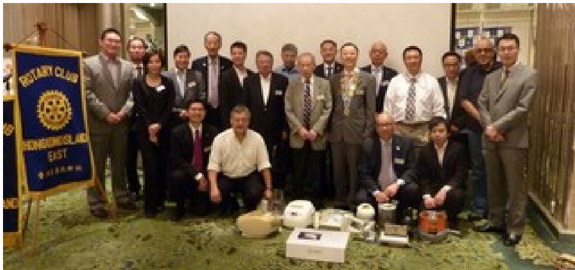
GROUP PHOTO WITH MEMBERS OF HK ISLAND EAST