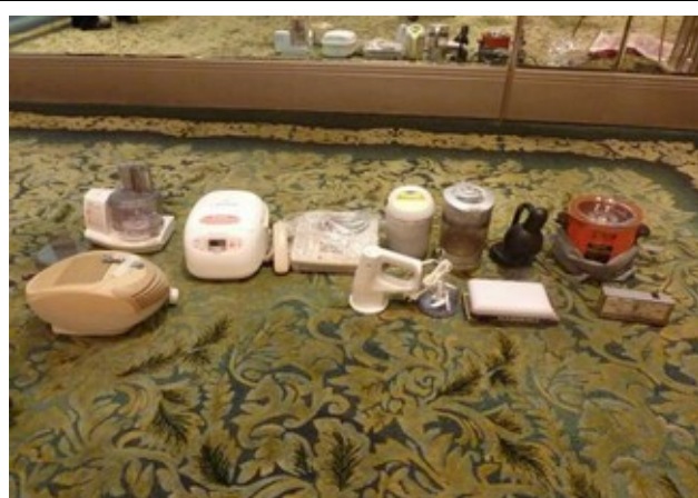
Electrical appliance to be donated to St. James Settlement Centre in Tuen Mun