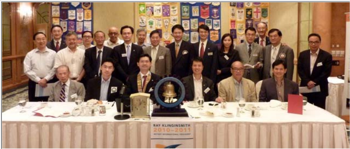
Group photos with guest speaker, visiting guests & Rotarians