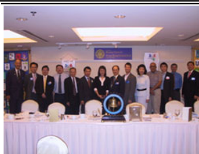
Group picture with guest, speaker & members