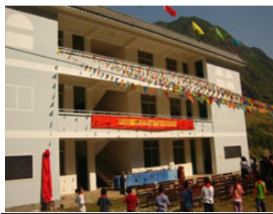
Another rebuilt school in Yunnan Province.