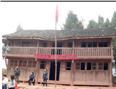
Another school to be rebuilt in Guizhou.