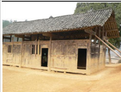
A school to be rebuilt in Guizhou Province.