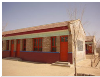
A rebuilt school in Gansu Province by U-Hearts.