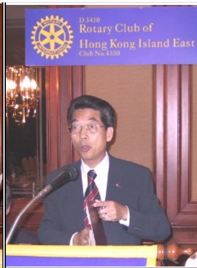
Acting SAA reporting on our intake for today.