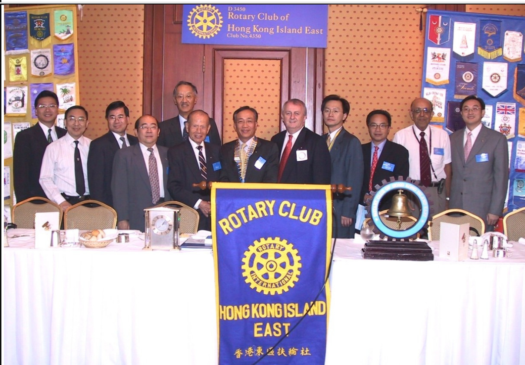
Group Photo of those present at our meeting on 29th October, 2003