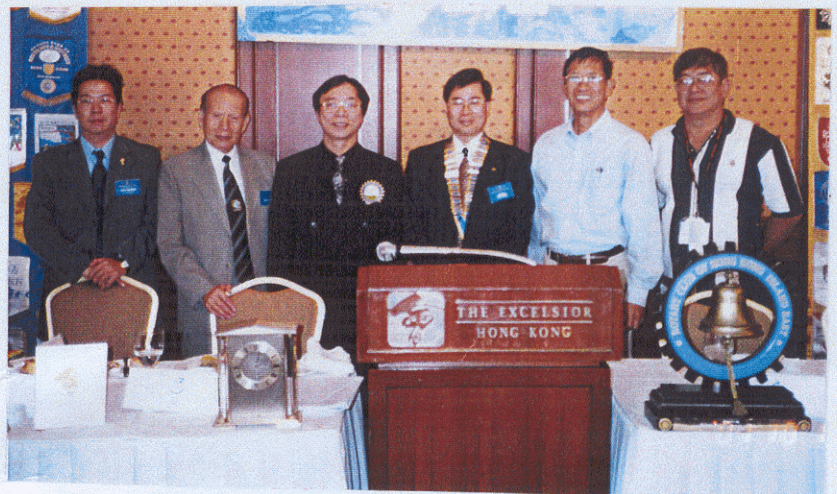
Group photo of October 17, 2001.