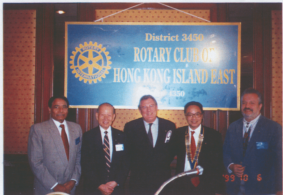
Our only visitor with Club executives at the meeting, 6 October, 1999.