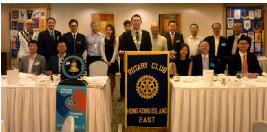
Group photo of members, visiting Rotarians and guests.