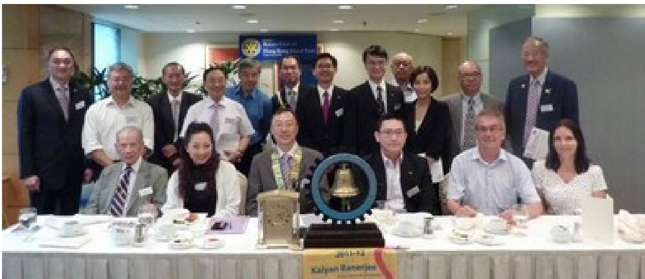
Group photo with visiting Rotarian & members