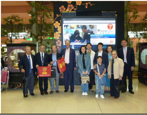
Our group being met at the airport on arrival