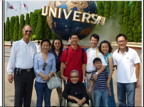
Our group shown here in front of the Universal Studio