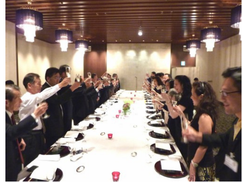
We were welcome to Osaka at a reception held on the 2nd of Oct.