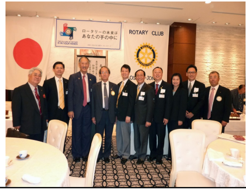
We attended their club meeting on 3rd Oct