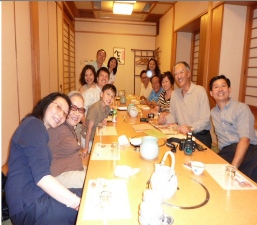
Our members and their families waiting for the crab luncheon that is coming up