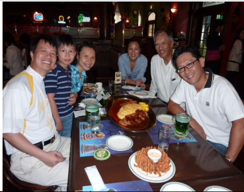
We enjoyed fellowship after our visit to Universal Studio