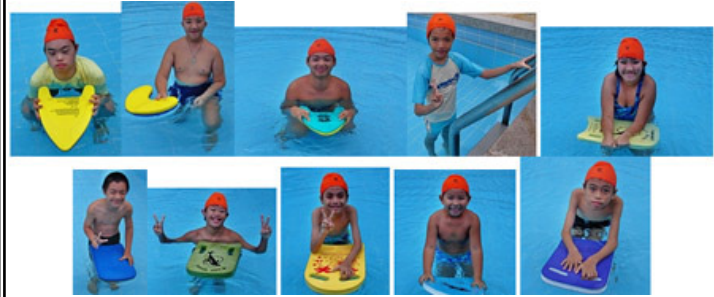
Part of the swimming team students of Choi Chun School under the sponsorship of our community service project "Swimming Above Self" to enhance their health and self confidence