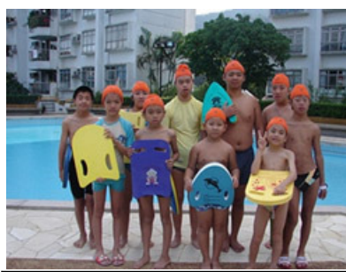
Choi Chun School Swimming Team