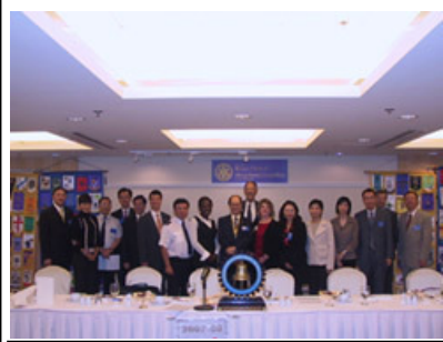
Group picture with guests & speaker