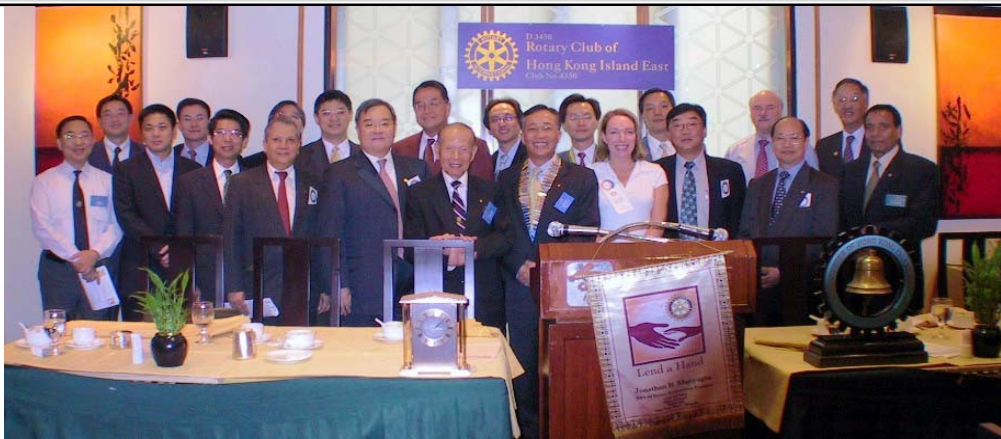
A group Photograph of those who were present during the weekly meeting on October 22, 2003.