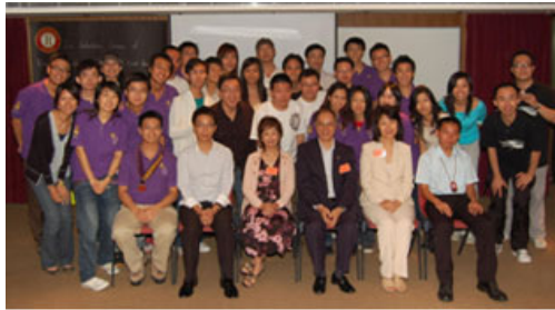
Group photo taken after the Joint Installation Ceremony and Project CD kicked off