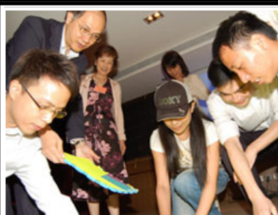
Team work to set up the kick-off symbol of the Project Competence