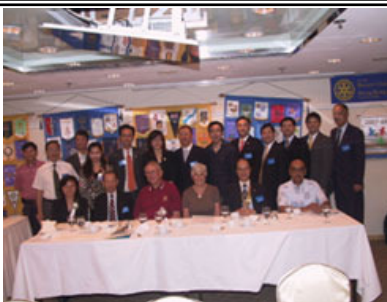
HKIE member group picture with speakers and visitors