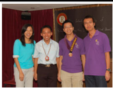
IPPs and Presidents of the RAC of Hong Kong Island East and Kowloon NW