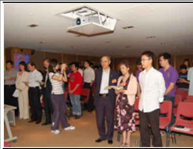
Every body stand up and sing the Rotaract song together before the Joint Installation Ceremony