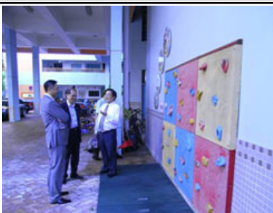
Part of the facilities in Choi Chun School